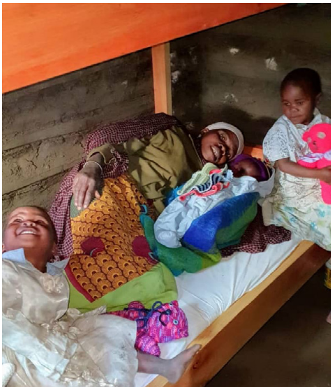
... and after.

The children who went to school got new school uniforms, shoes, and school bags. They were so excited about their new uniforms because the old ones were very much worn. The pants were worn thin with big holes on the back showing their underwear. They were teased by the other students.