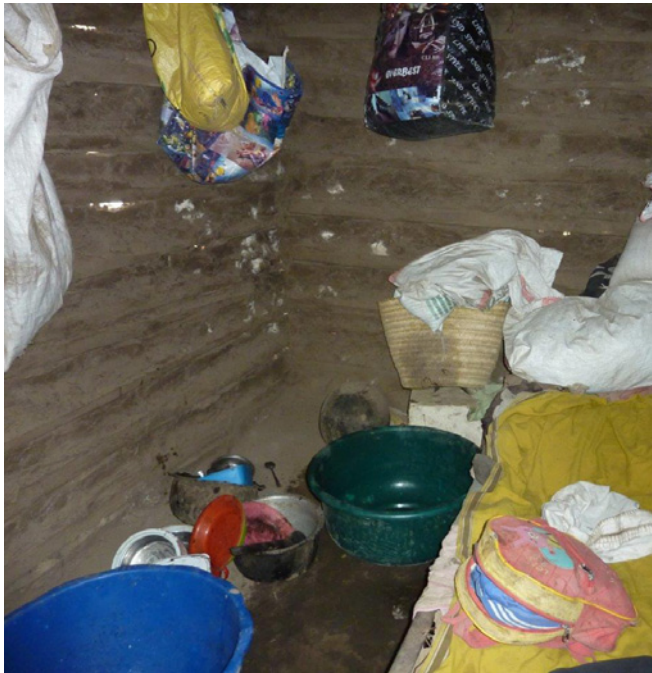
One of the family rooms – before ...

We also bought corn, beans, and sugar. You should have seen the children when they saw the food. The older ones ran to get some wood for the stove. It really hurt to see how hungry there were.